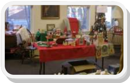
Christmas Corner, new this year.

Thanks to all who helped hold the 80th St. Paul's Christmas Fair! Preparations are in full swing as this issue is being printed.