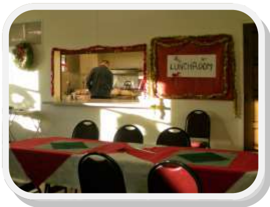
Cooks in the kitchen, Christmas Café will serve lunch 11-1. Come eat it smells delicious!