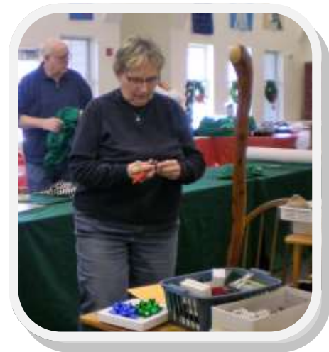
Treasures being unwrapped and priced.

Thanks to all who helped hold the 80th St. Paul's Christmas Fair! Preparations are in full swing as this issue is being printed.